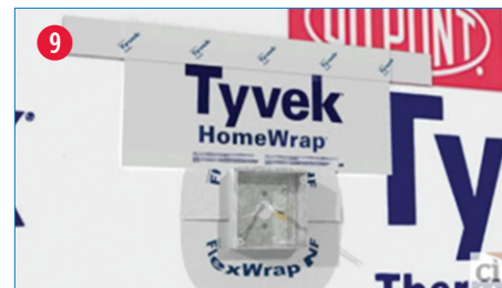
9. Flash all penetrations with DuPont™ self-adhered flashing systems products.