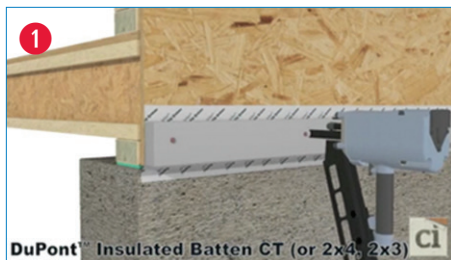
1. Bottom of wall detail

INSTALLATION CHECKLIST FOR VINYL, BRICK, AND NATURAL STONE SIDINGS