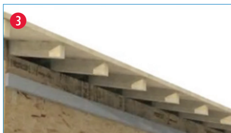
3. Top of wall detail (Eave and Gable).

See reverse side of the page for more details on Steps 1-11.