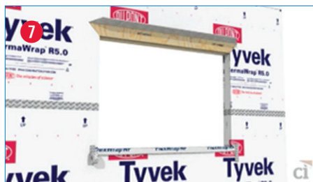
7. Cut and prepare window/door openings.