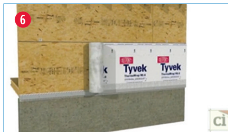
6. Install DuPont™ Tyvek® ThermaWrap™ R5.0, working from the bottom up and right-to-left.