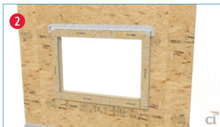
2. Bump-out frame around all window and door openings and penetrations larger than 1".