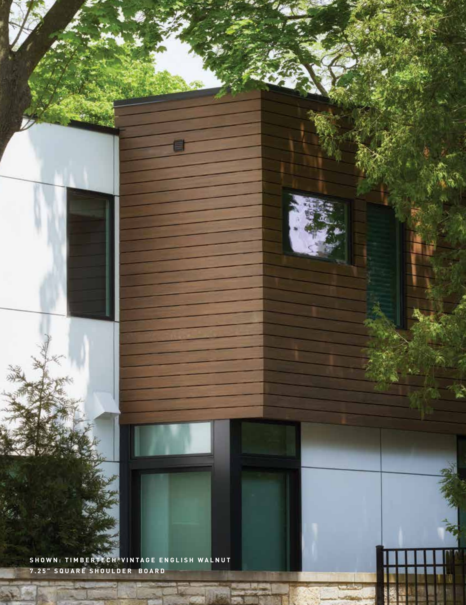
SHOWN: TIMBERTECH® VINTAGE ENGLISH WALNUT 7.25" SQUARE SHOULDER BOARD

With an unmatched portfolio of diverse colors, wood grain patterns, and board widths, the design potential with AZEK Cladding is nearly limitless. Moisture- and fade-resistant capped polymer technology, AZEK Cladding boards protect the integrity of your design vision for years to come. Build on the rich hues and textures of your AZEK Cladding application to highlight an entryway, add design detail to a porch ceiling, or as one element among mixed building materials for a clean, dimensional finish. When you choose AZEK Cladding, you choose the aesthetic beauty of wood with the unrivaled performance your design deserves.