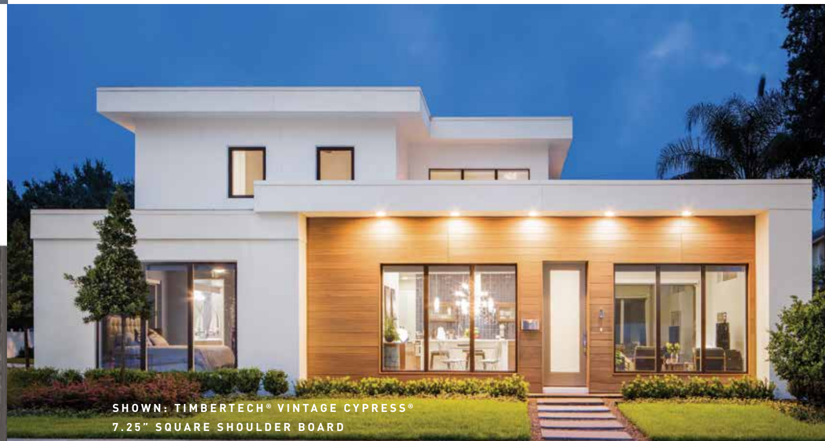
SHOWN: TIMBERTECH® VINTAGE CYPRESS® 7.25" SQUARE SHOULDER BOARD