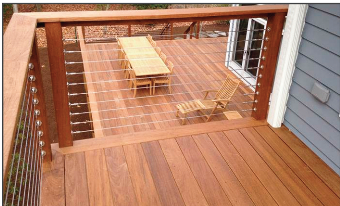
Iron Woods® Ipe Vanish Decking™

Choose the right product for your project. Budget, Climate, Aesthetics and Site Conditions all impact product, profile, and species selections.