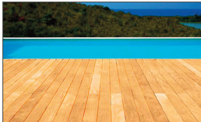
Iron Woods® Garapa Gold™ Vanish Decking™