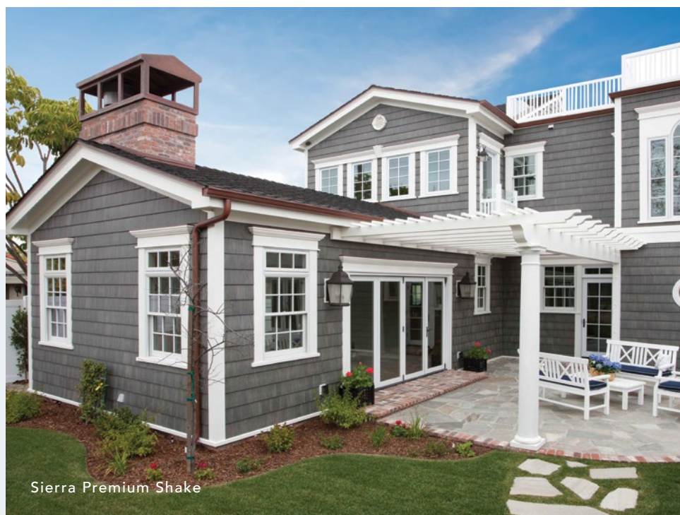
Sierra Premium Shake

Savannah Smooth and Sierra Premium Shake offer two unique looks with equally gorgeous appeal. Due to their half-inch thick construction, both cast dramatic shadow lines that provide the premium look homeowners are after. Whether paired together or used alone, this dynamic duo is known for standing out in the crowd.