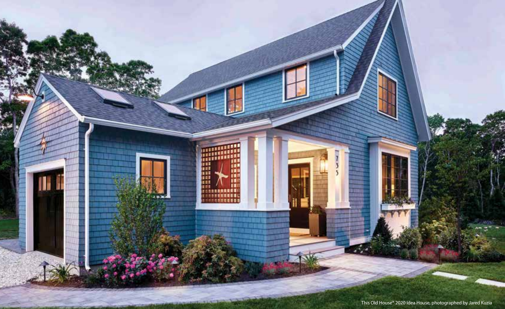
This Old House® 2020 Idea House, photographed by Jared Kuzia