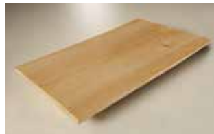
Sidewall Select AB