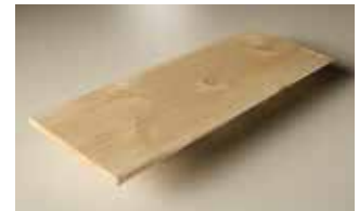
2 nd Clear C